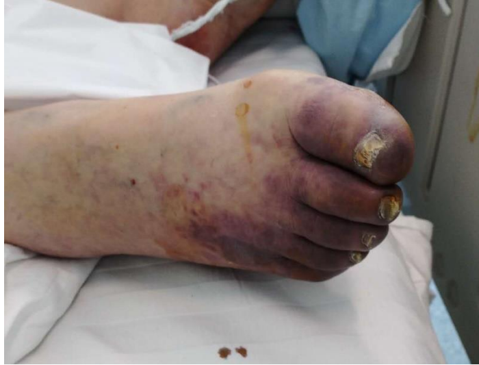
Figure.2 Ischemic changes of toes in one COVID-19 patient with severe type.