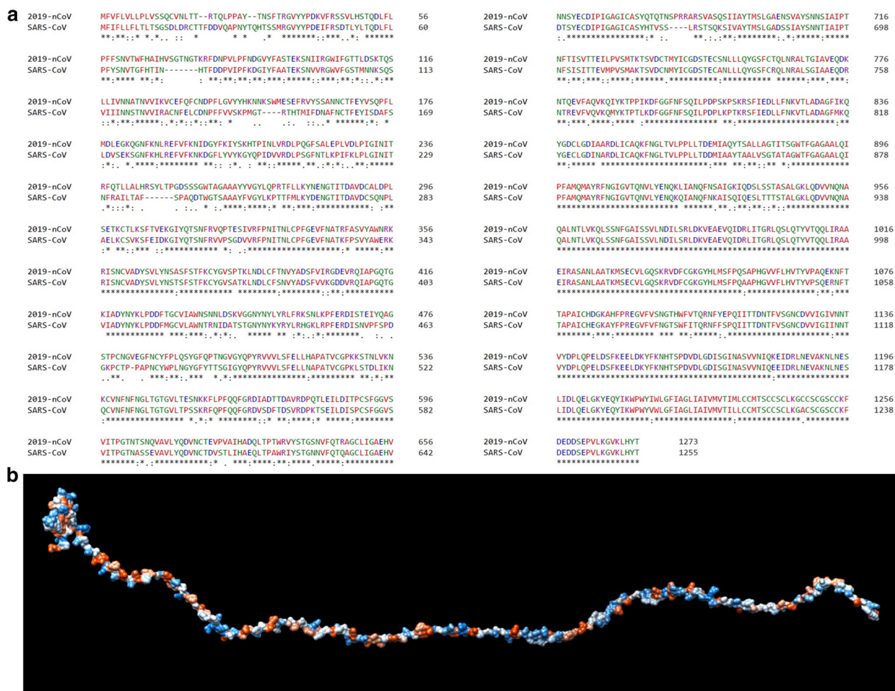
Fig. 2 Sequence variation of spike glycoprotein. a The complete amino acid sequences of spike glycoprotein of 2019-nCoV and SARS-CoV are shown as described earlier. Standard single-letter abbreviations for the amino acids were used. The collinear sequences were aligned by online use of Clustal Omega. Amino acid alignment

and results were compared for the epitopes with score > 0.7. The CTL epitopes were validated by another software MHC-I Binding Predictions from IEDB Analysis Resource ( https://tools.iedb.org/mhci/ ) [23].